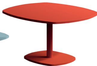
T Circa HPL ht40 70C ep39 HP39