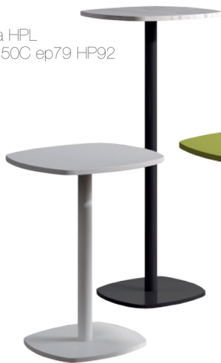
T Circa HPL ht110 50C ep79 HP92