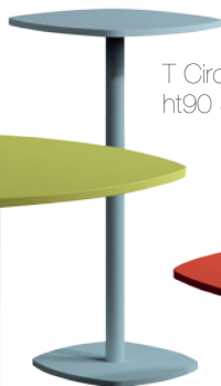
T Circa HPL ht90 50C ep59 HP59