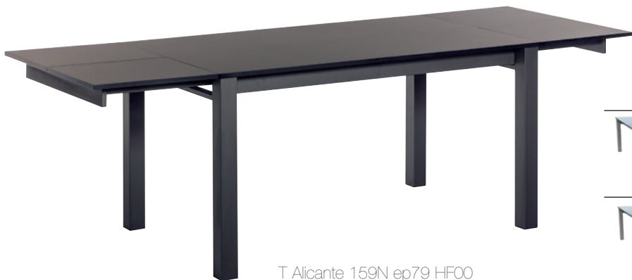
T Alicante 159N ep79 HF00