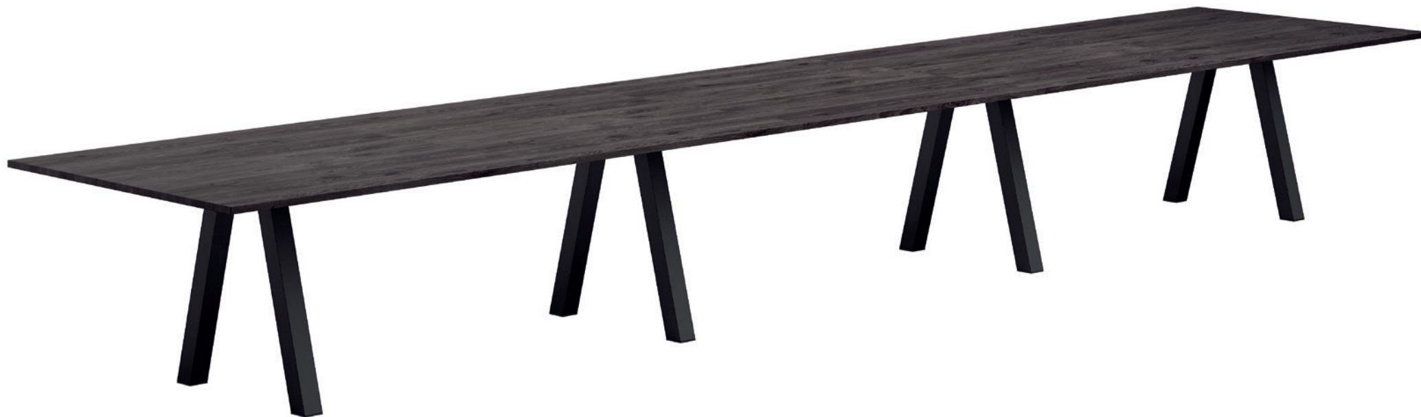
T Veneto XL ht75 600 ep01 HP08